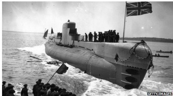
Launch of HMS PERSEUS 1929

The article below is from “BBC News Magazine” and has been severely edited to take out the “dramatic civvy crap” not suitable in our Newsletter nor to ex-submariners.